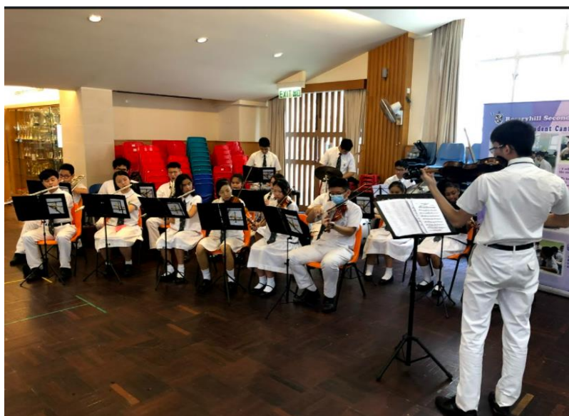
樂器班 Instrumental Class